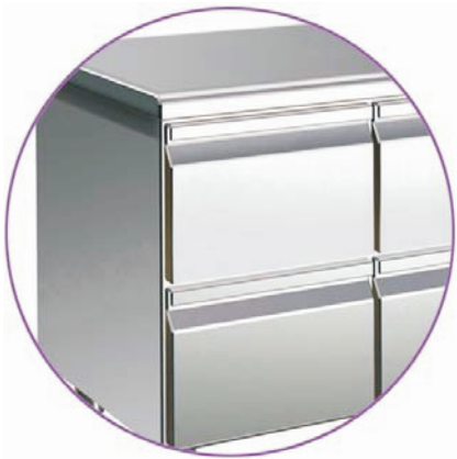
SET 2 DRAWER FOR BEER