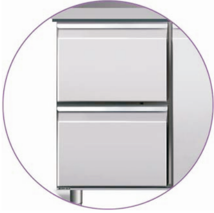
SET 2 DRAWER / 700 SET 3 DRAWER / 600