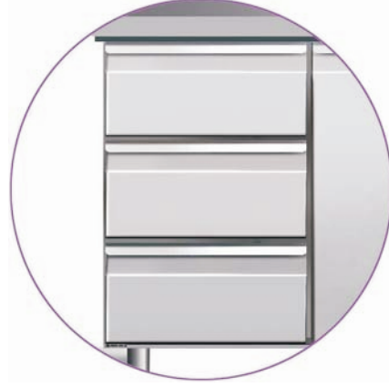
SET 2 DRAWER / 700 SET 3 DRAWER / 600